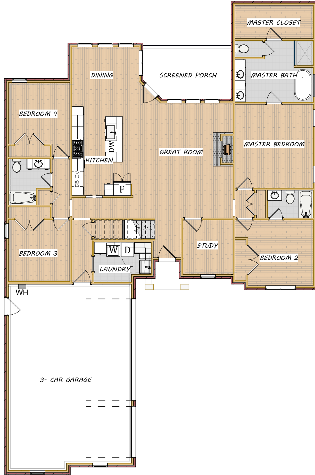
① Level 1 Layout 1" = 10'-0"