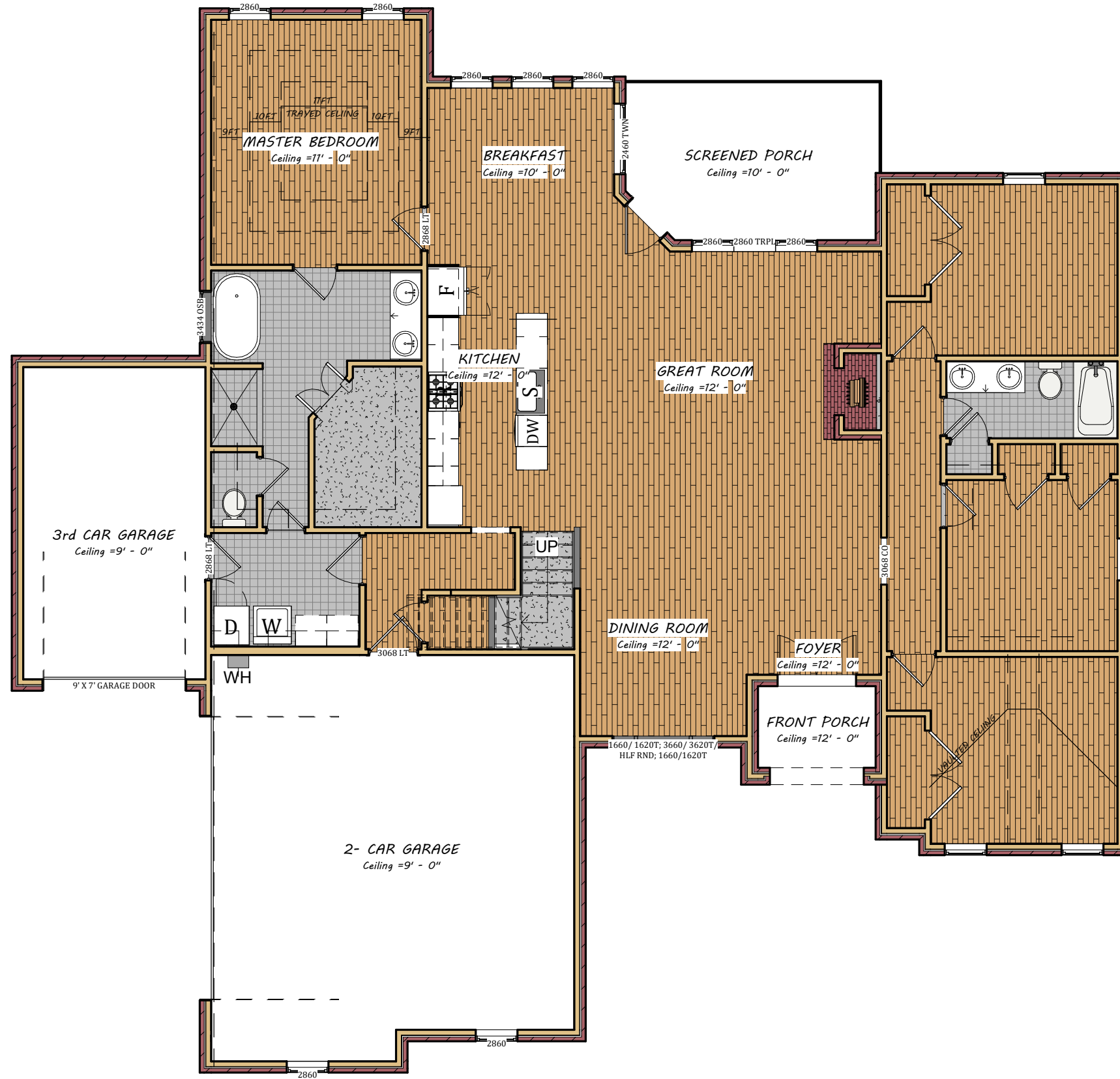
1 Level 1 Layout 1/8" = 1'-0"