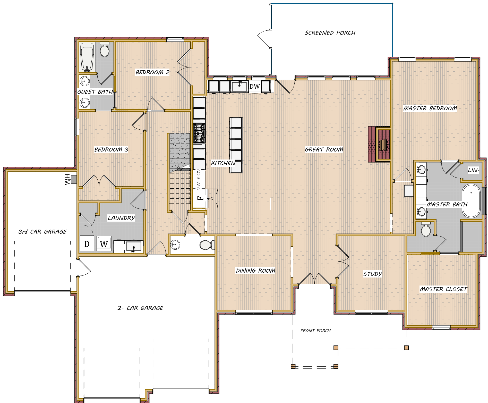
1 Level 1 Overall 1/8" = 1'-0"